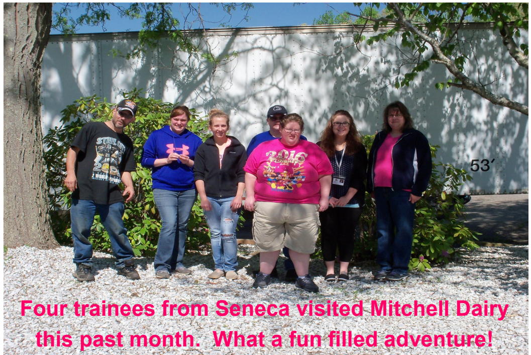
Four trainees from Seneca visited Mitchell Dairy this past month. What a fun filled adventure!